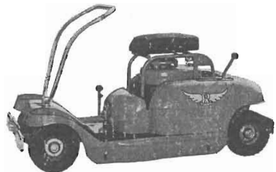
Model (Rotary) 26-VR-D 5.5 hp. — 26" Cutting Width.

Look at these Features — Auto Styling, 12 Volt Lauson-Bendix type starter with alternator charger and battery — Unit Engine Control — 4 Speed Trans. — Positive Blade Control — Close Side Cut — Safety Skirts Float. Ideal for contract lawn maintenance.